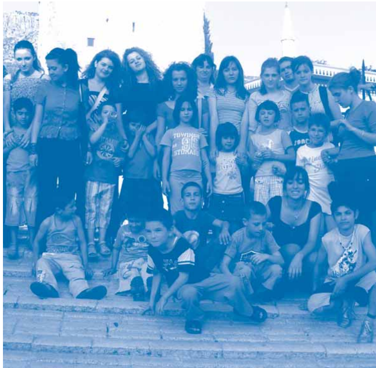
(Left) H.M. Queen Noor of Jordan and Presiding Minister of the Council of Ministers of BiH, Nikola Špirić during UWCiM Official Opening Ceremony