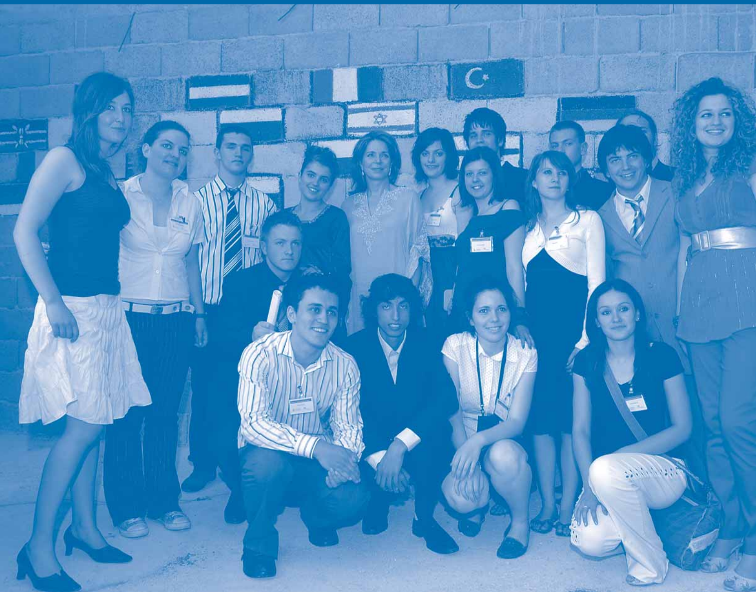
H.M. Queen Noor of Jordan with UWCiM students