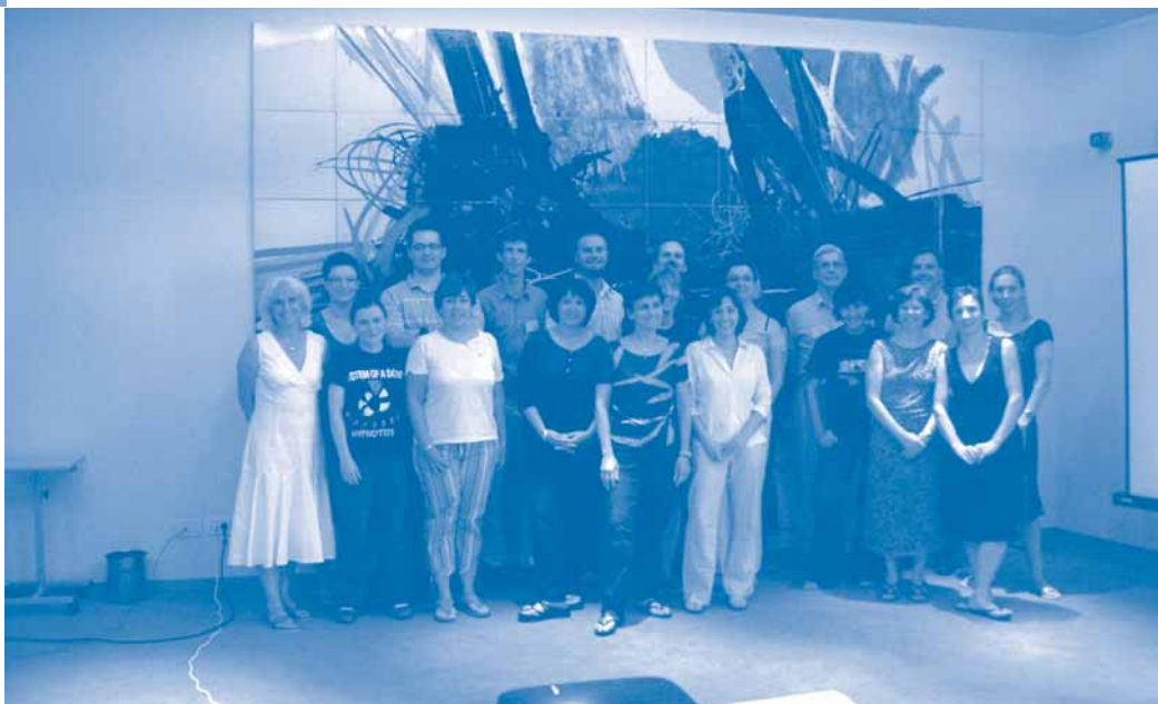
Participants of Interregional Teachers Training Programme PACE