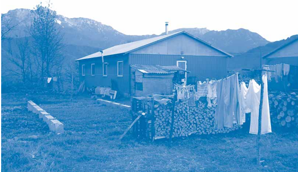
Refugee camp in Jablanica