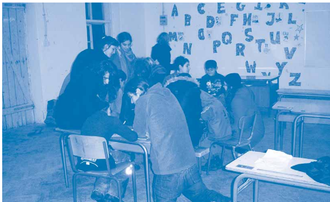
UWCiM students during the service with Roma children