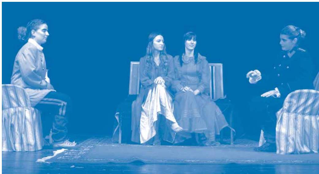
UWCiM Winter Arts Festival - A detail from the theatre play performance 'The Pretentious Young Ladies'