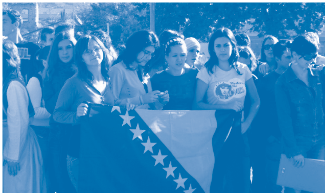
Cultural day of South-East Europe in UWCiM

Most of the teachers are experienced instructors of the IB program and come from BiH, Bulgaria, Canada, Croatia, Finland, Kenya, South Africa/Italy and the UK.