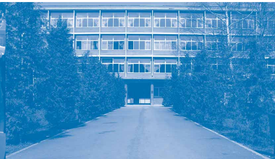
Second Gymnasium Sarajevo