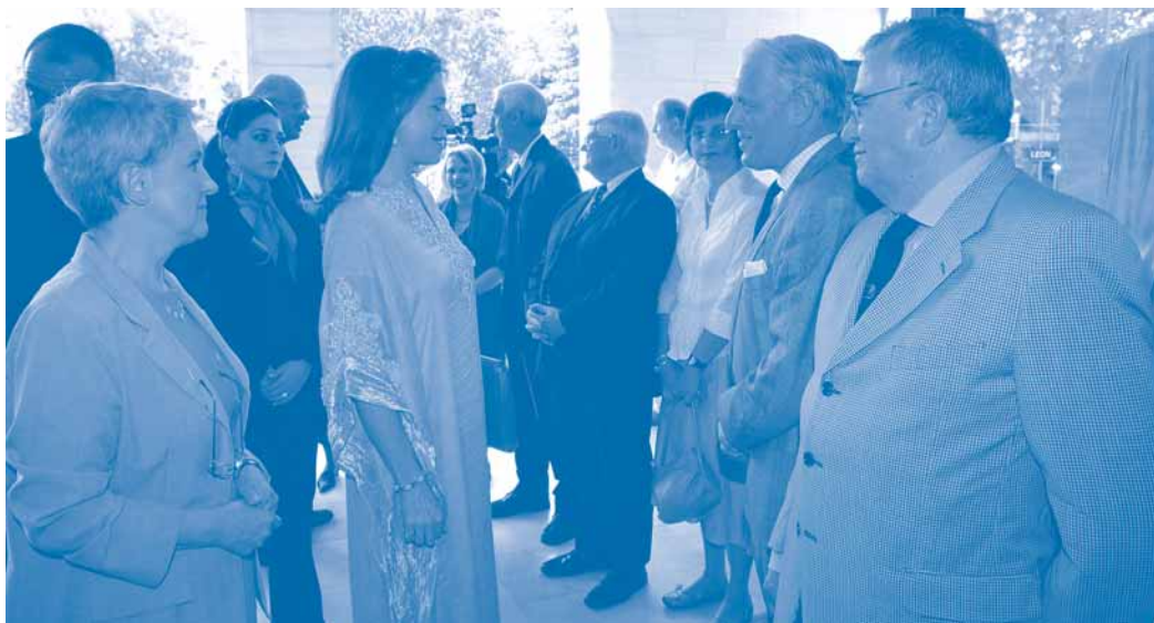
Members of the UWC-IBO Initiative’s Executive Committee with H.M. Queen Noor during UWCiM Official Opening Ceremony