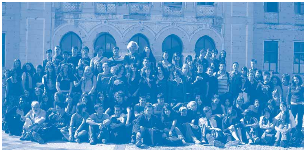
2 nd generation of UWCiM students and teachers in front of Mostar Gymnasium

The UWC-IBO Initiative has so far secured 3.6 million Euros towards core costs of the programme, for 1st and 2nd generations of students and for development activities for teachers and policy makers. The Initiative is now raising funds for the 2nd and 3rd generation of student. The UWC-IBO Initiative in Bosnia and Herzegovina is grateful to the following donors who have contributed to the Initiative by the time of this publication: