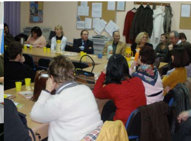
MEETING OF GYMNASIUM MOSTAR AND UWCiM STAFF

"UWCiM students are placing an enormous effort in cooperation with Gymnasium Mostar, organizing numerous events in order to animate the whole school community and make them sensitive to the issues that Mostar needs to deal with."