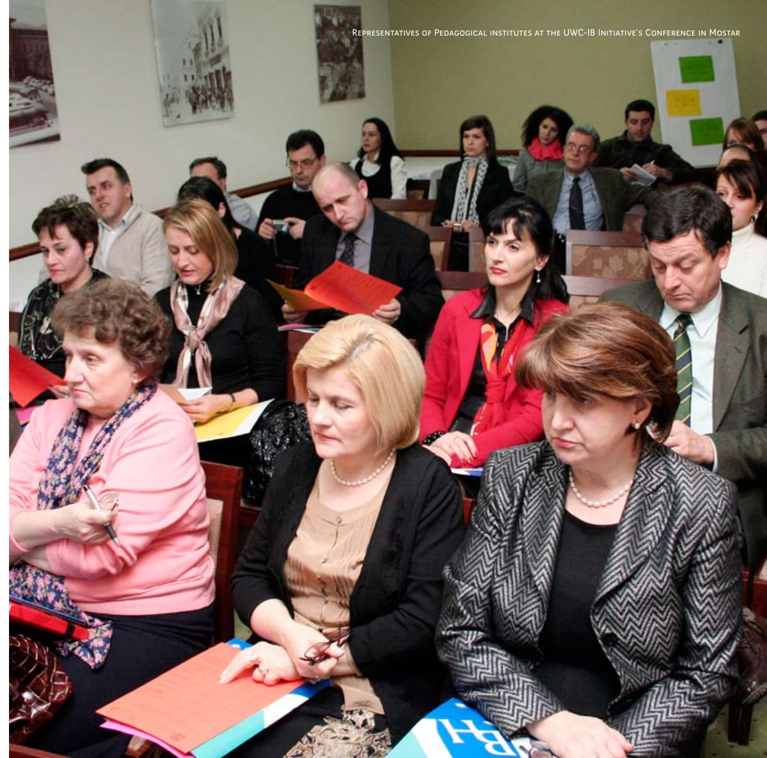
REPRESENTATIVES OF PEDAGOGICAL INSTITUTES AT THE UWC-IB INITIATIVE'S CONFERENCE IN MOSTAR

Director of the Centre for Professional Development of Teachers, Slovenia