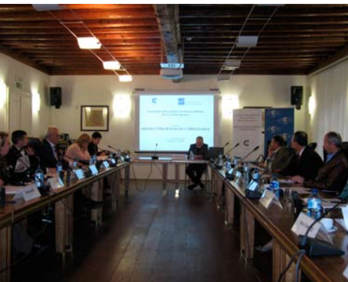
STUDY VISIT TO SLOVENIA FOR BIH GYMNASIUM HEADTEACHERS