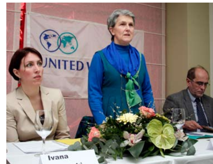
OFFICIAL OPENING OF THE UWC-IB CONFERENCE IN MOSTAR