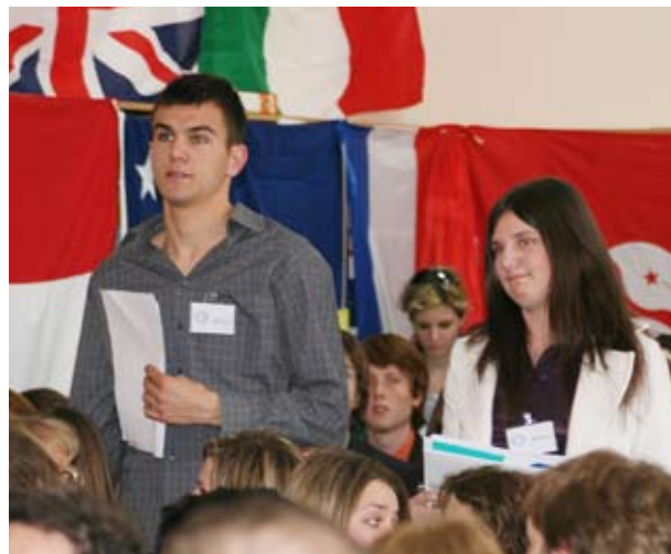
MOSTMUN 2009: OPENING SESSION

The MostMUN 2009 was the biggest Model United Nations Conference ever organized in UWCiM. It gathered more than 130 students from eight Mostar high schools, IB students from Sarajevo and Banja Luka as well as students from Croatia, Kosovo, Montenegro, Slovakia, Slovenia and Serbia. The MUN Conference was also significant because of the partnership with the two Mostar universities. "In three years since the College's foundation, the public interest in the event has grown significantly. This year more than 30 international delegates