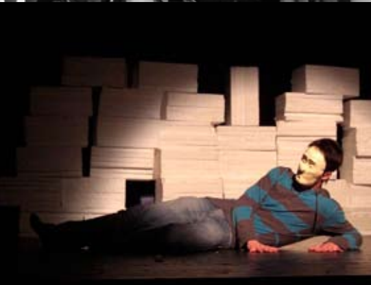
NEWLY EQUIPPED UWCiM'S THEATRE AND VISUAL ARTS STUDIOS

ing best educational practice; to continue close cooperation with other IB schools in BiH, namely Second Gymnasium Sarajevo and Gymnasium Banja Luka, and together demonstrate a possible path for education reform in BiH.