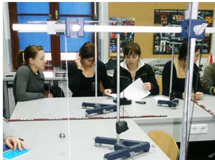
EXTRACURRICULAR SCIENCE CLASSES FOR GYMNASIUM MOSTAR STUDENTS: PHYSICS

Extra curriculum Biology, Chemistry and Physics classes were attended by the entire Gymnasium Mostar student body. The classes gathered Science teachers from both curricula who were together devising practicals for mixed groups of Gymnasium Mostar students. The practicals were assisted by UWCiM laboratory technicians. Once again the extra curriculum Science classes proved to be extremely beneficial for Gymnasium Mostar students, especially for those interested to study sciences at university level.