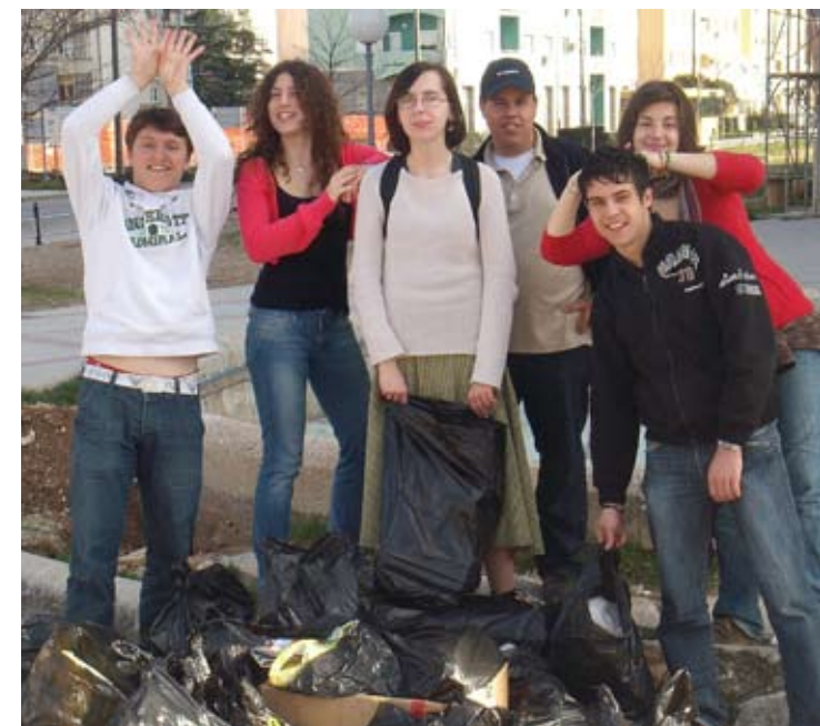
PAPER COLLECTION ACTION