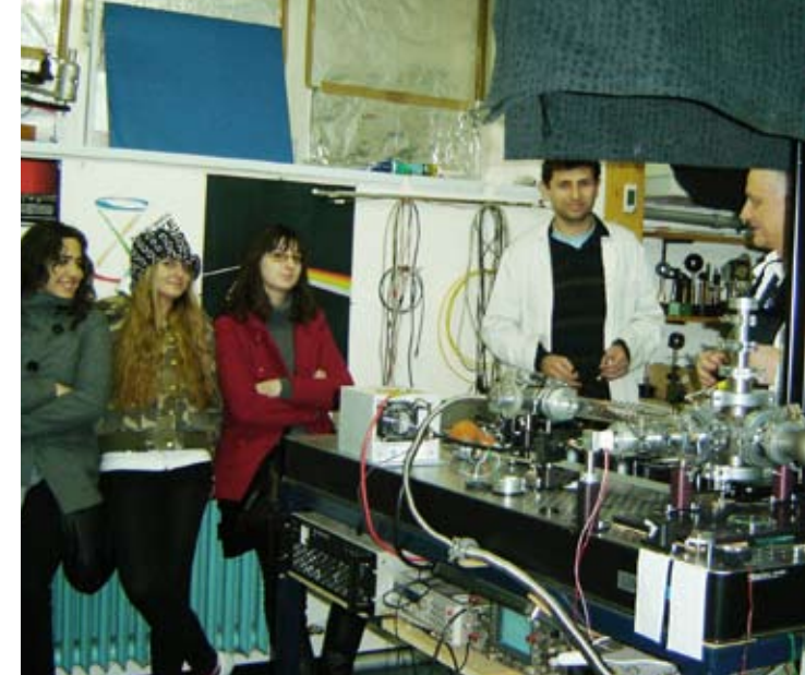
PROJECT WEEK: VISIT TO PHYSICS DEPARTMENT OF UNIVERSITY OF ZAGREB