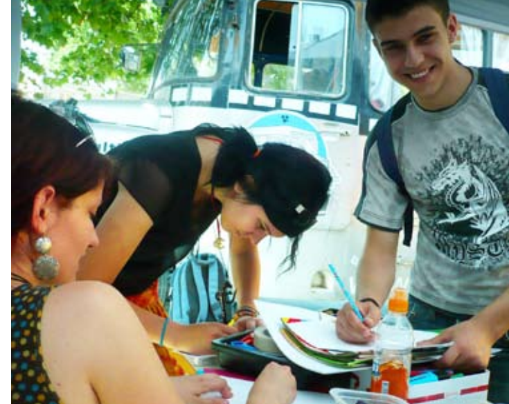
JOINT FILM AND ANIMATION WORKSHOP WITH GYMNASIUM MOSTAR STUDENTS