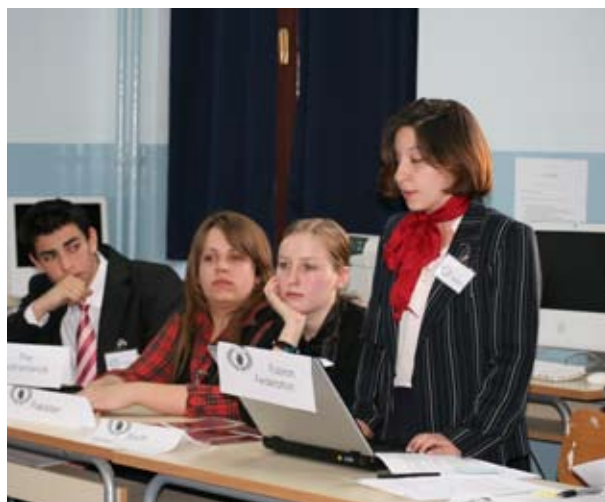
MOSTMUN 2009: COMMITTEE DISCUSSION

range of projects included art and theatre projects, hiking and skiing, as well as various academic research and voluntary work mostly conducted in cooperation with other high schools all over BiH; the cooperation with the American International School of Zagreb successfully established