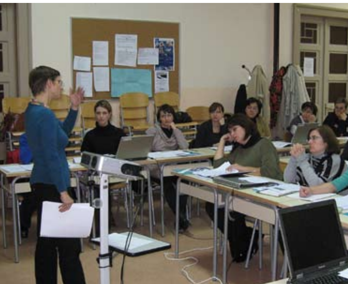
PROFESSIONAL WORKSHOP FOR THE GERMAN LANGUAGE TEACHERS