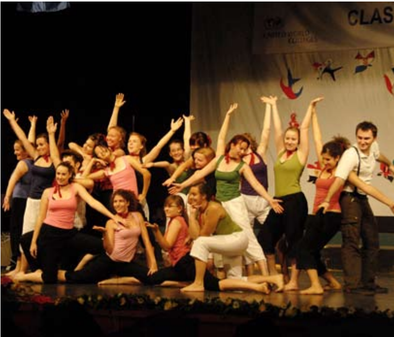
ENTERTAINMENT PROGRAMME AT THE GRADUATION CEREMONY