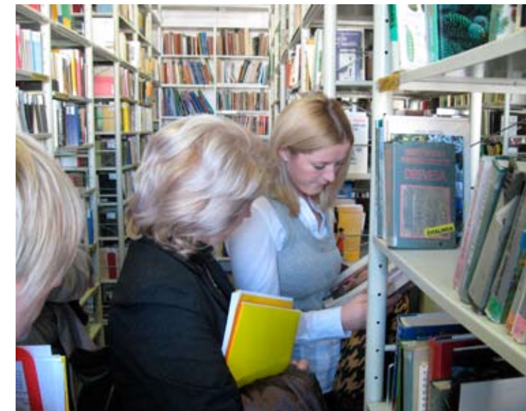
VISIT TO GYMNASIUM BEŽIGRAD