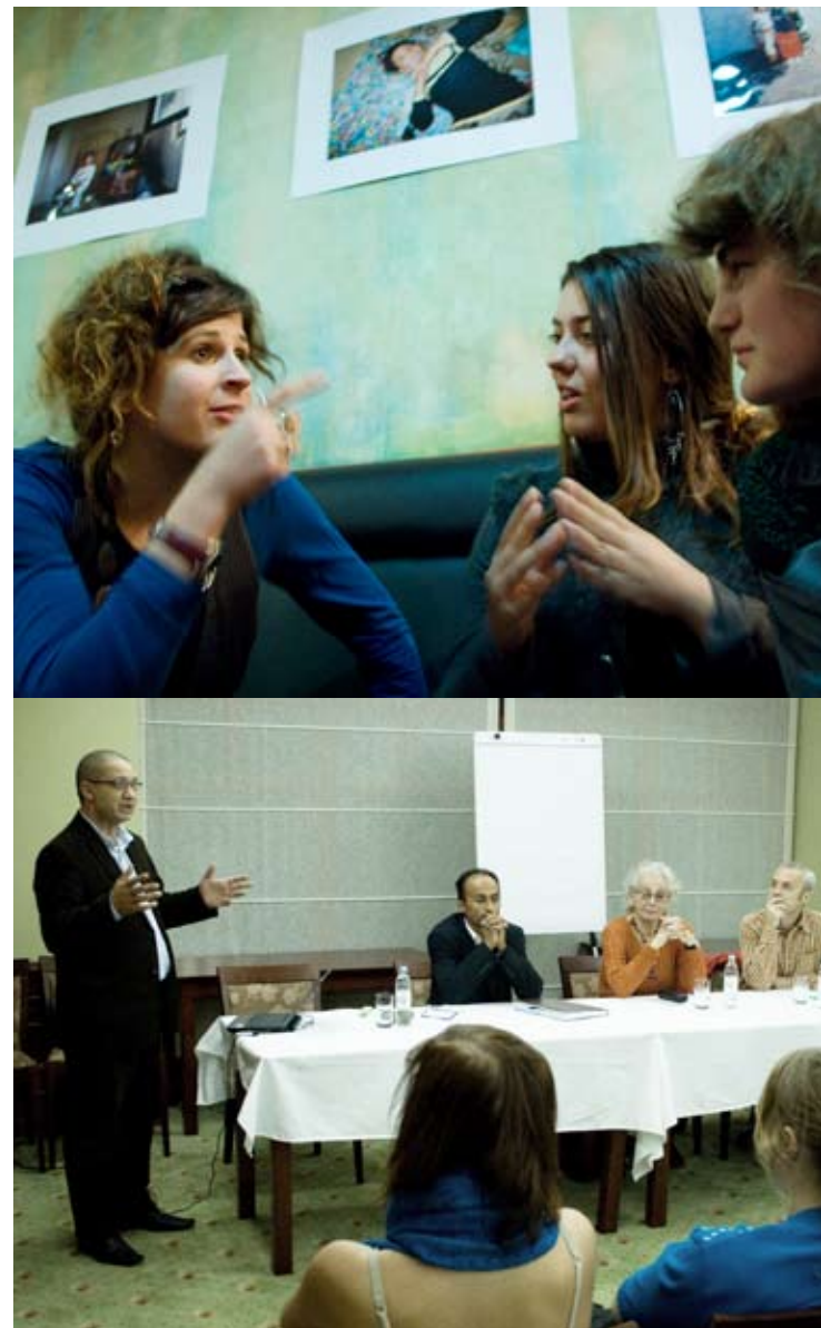
“ROMA AWARENESS WEEK”: PHOTO EXHIBITION, PUBLIC LECTURES, LIFE OF ROMA