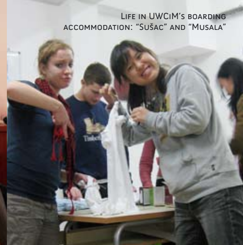
LIFE IN UWCiM'S BOARDING ACCOMMODATION: "SUŠAC" AND "MUSALA"

"Coming to live in Mostar made me feel independent of my family and at that point all I was used to before had gone. Residence life has thought me: to be able to share space with people from different backgrounds, to adapt and be able to accept different opinions and how to get more mature. Residence life made a new, more mature and independent person out of me."