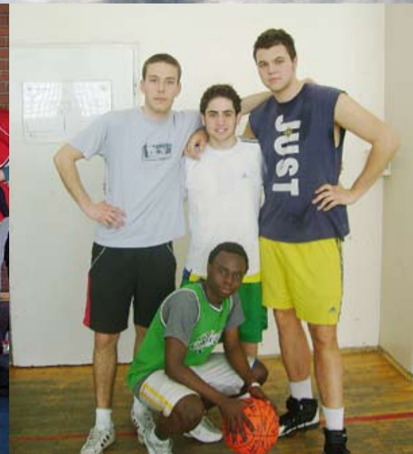
“SPORT WITHOUT BORDERS”: VOLLEYBALL AND BASKETBALL