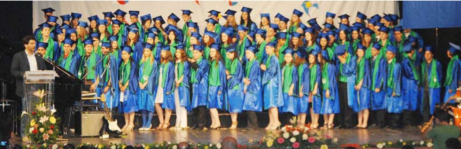
DANIS TANOVIĆ ADDRESS TO STUDENTS ON UWCiM 2ND GRADUATION CEREMONY