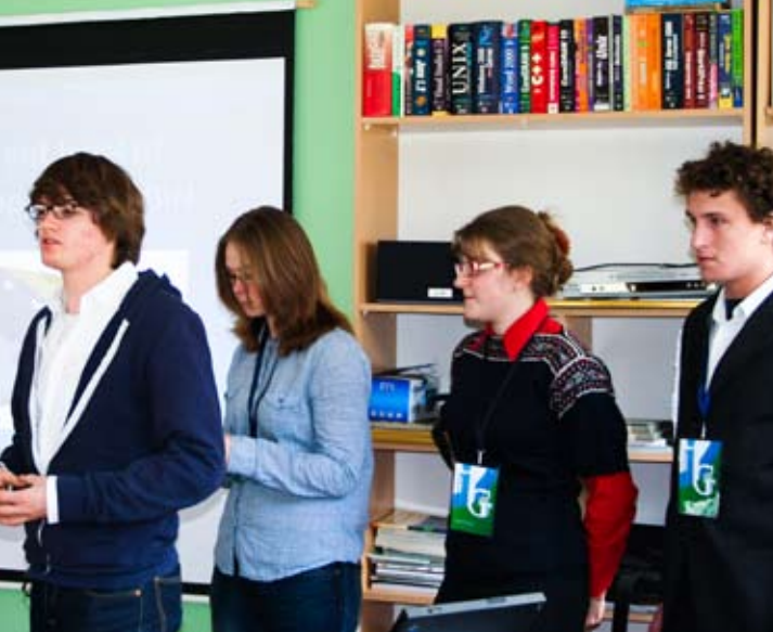
UWCiM STUDENTS ON ECONOMIC FORUM IN BELGRADE