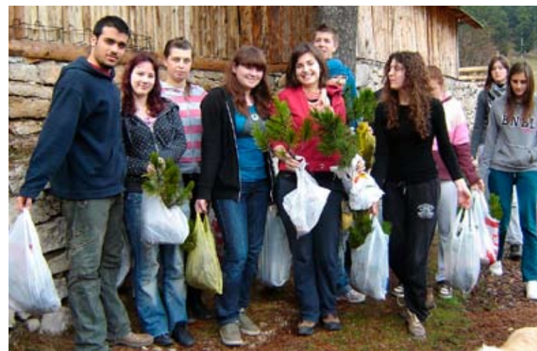
TREE PLANTING ACTION ON RUJIŠTE

The purpose of the project was to make a network of high-school students dealing with environmental issues in Mostar and its surroundings. Preparations for the project started in September 2008 with the idea to organize several ecology workshops for participants and to prepare a booklet for peers' education. Additionally, several ecological actions were organized including paper collecting, tree planting and street and park cleaning.