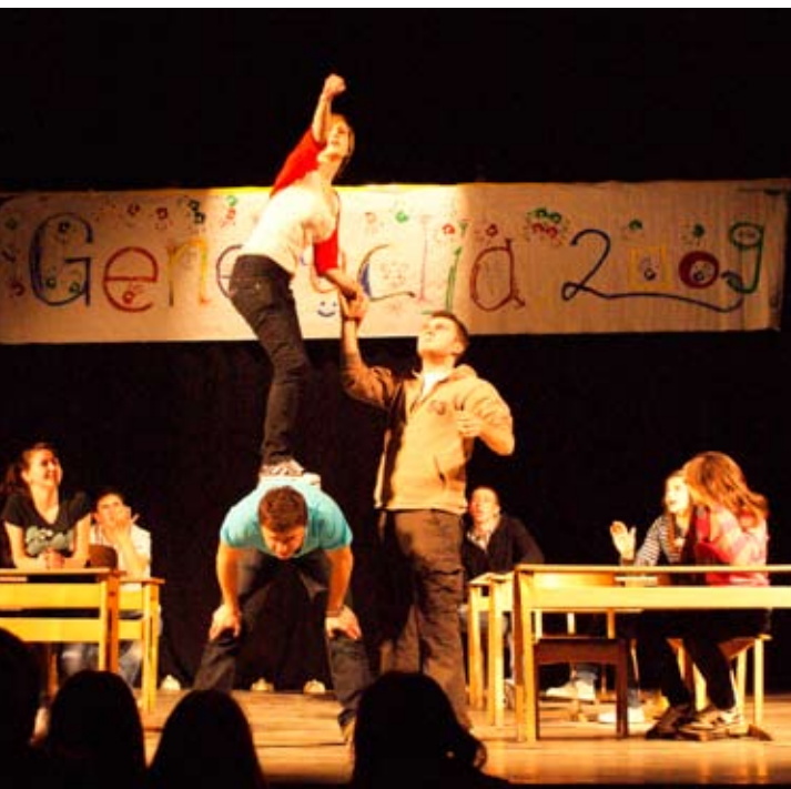
REWARDED THEATRE PLAY "CLASS 2009"