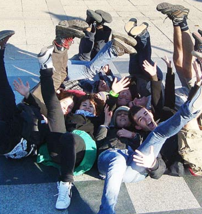
SHINY HAPPY UWCiM STUDENTS