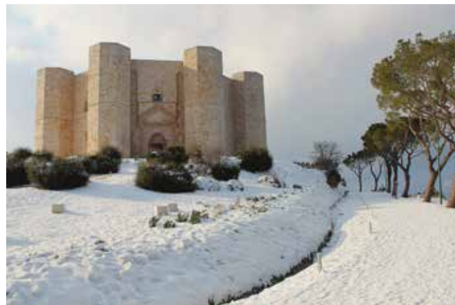
Castel del Monte, by Emilio Trotta, Italy.