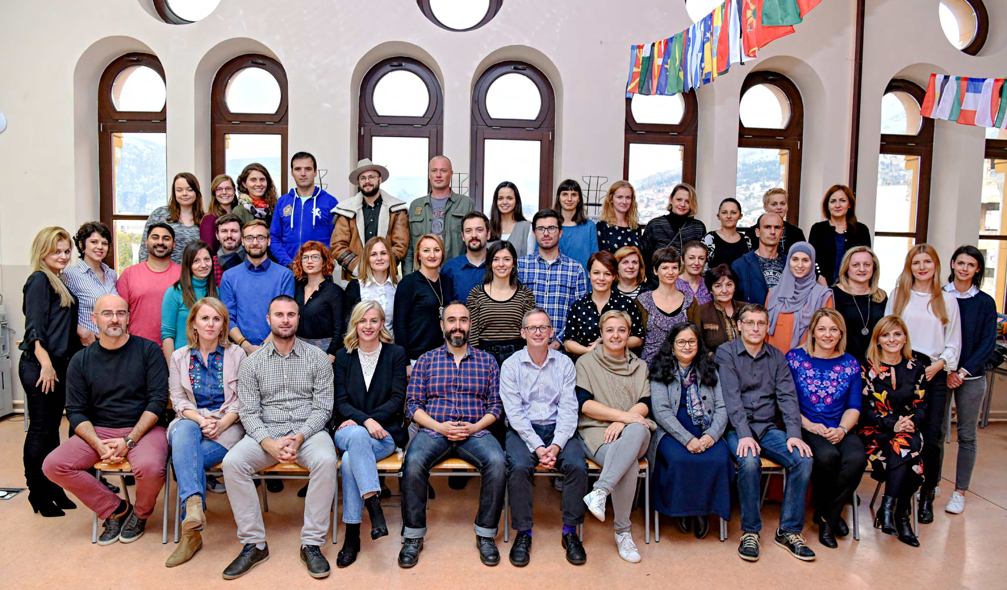
UWC MOSTAR STAFF 2018.