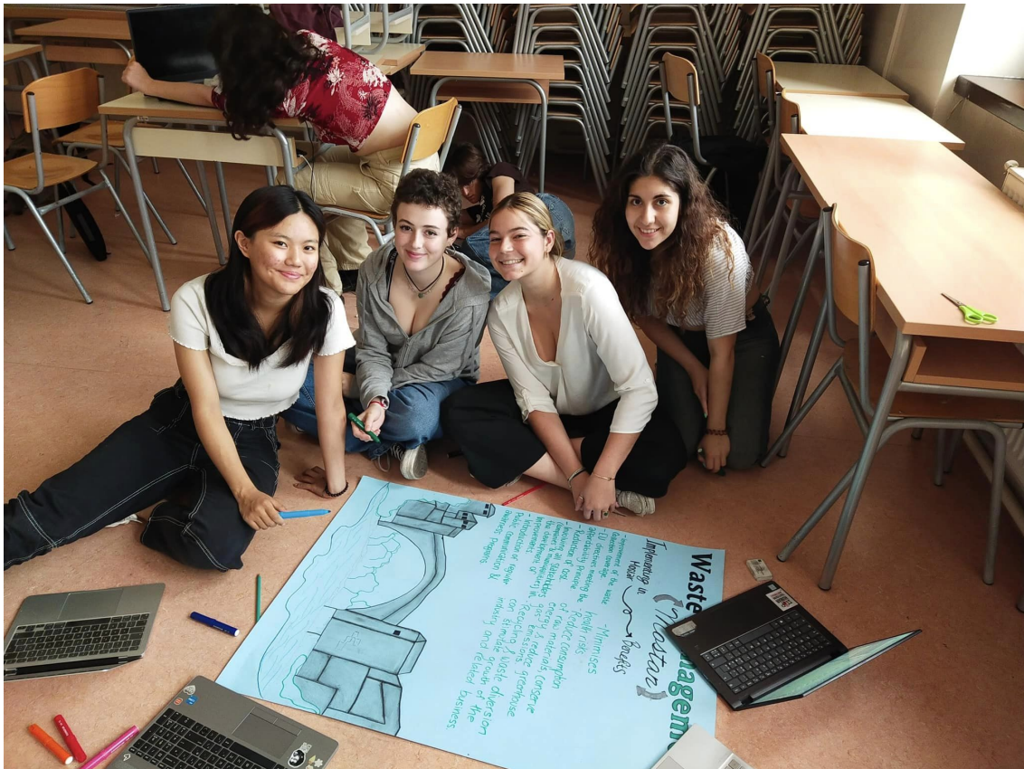
UWC Mostar - Science Department and Susitainable Cities

The great work of our Science Department is always in full swing! This time, we are proud to present their latest collaborative project!