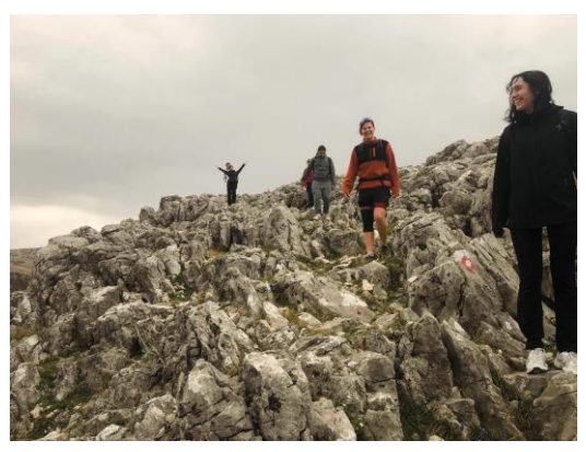
Greetings from "Velika Vlajna", "Fortica", and "Podvelež"- Outdoor Activities at UWC Mostar, March 2025