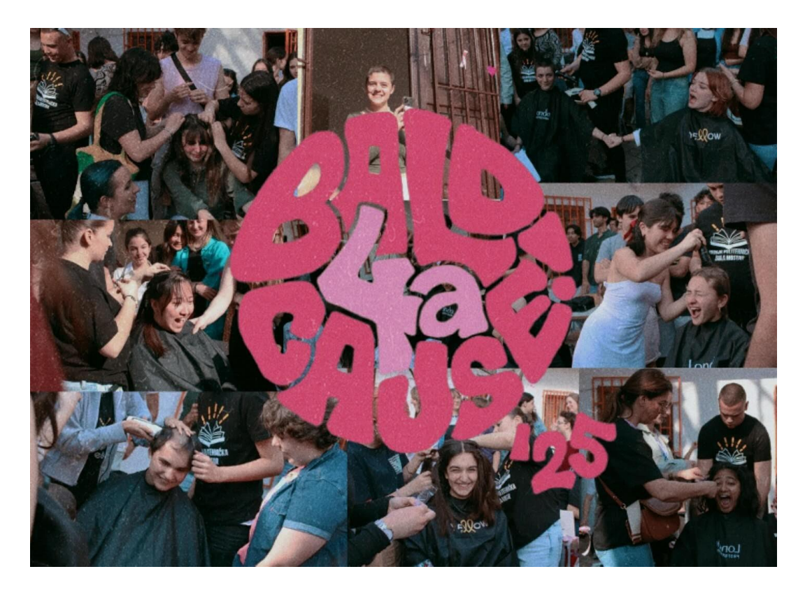
"Bald for a Cause 2025"

This great student initiated event is taking place for the fifth time and aims towards collecting donations for Association "Novi Pogled" and supporting the Association and their families throughout breast cancer treatments, while raising awareness about the importance of health care.