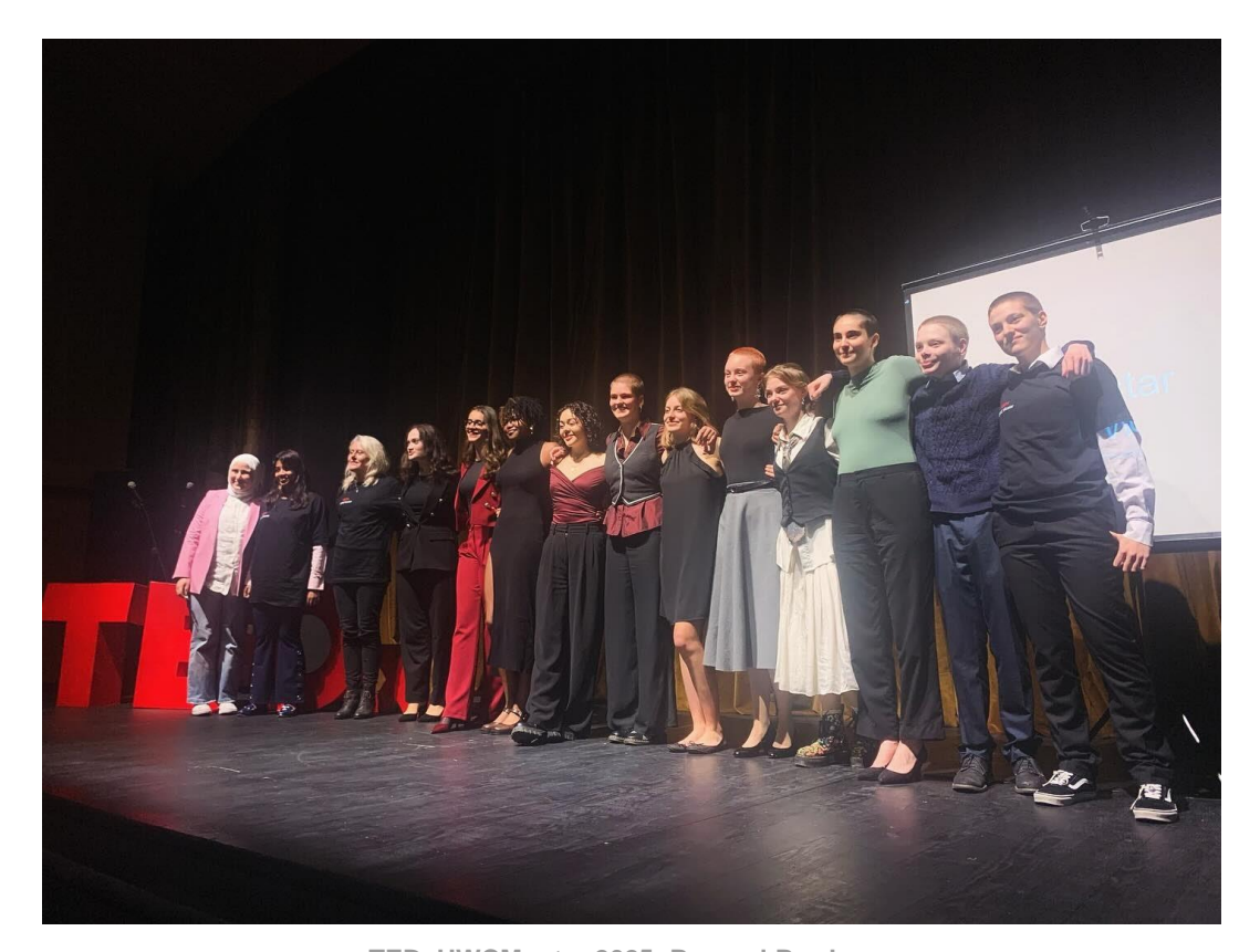
TEDxUWCMostar 2025: Beyond Borders

At UWC Mostar, we believe in challenging limits, breaking barriers, and redefining possibilities. This year's TEDx theme, "Beyond Borders," invited speakers to push the boundaries—not just of geography, but of thought, identity, innovation, and human connection.