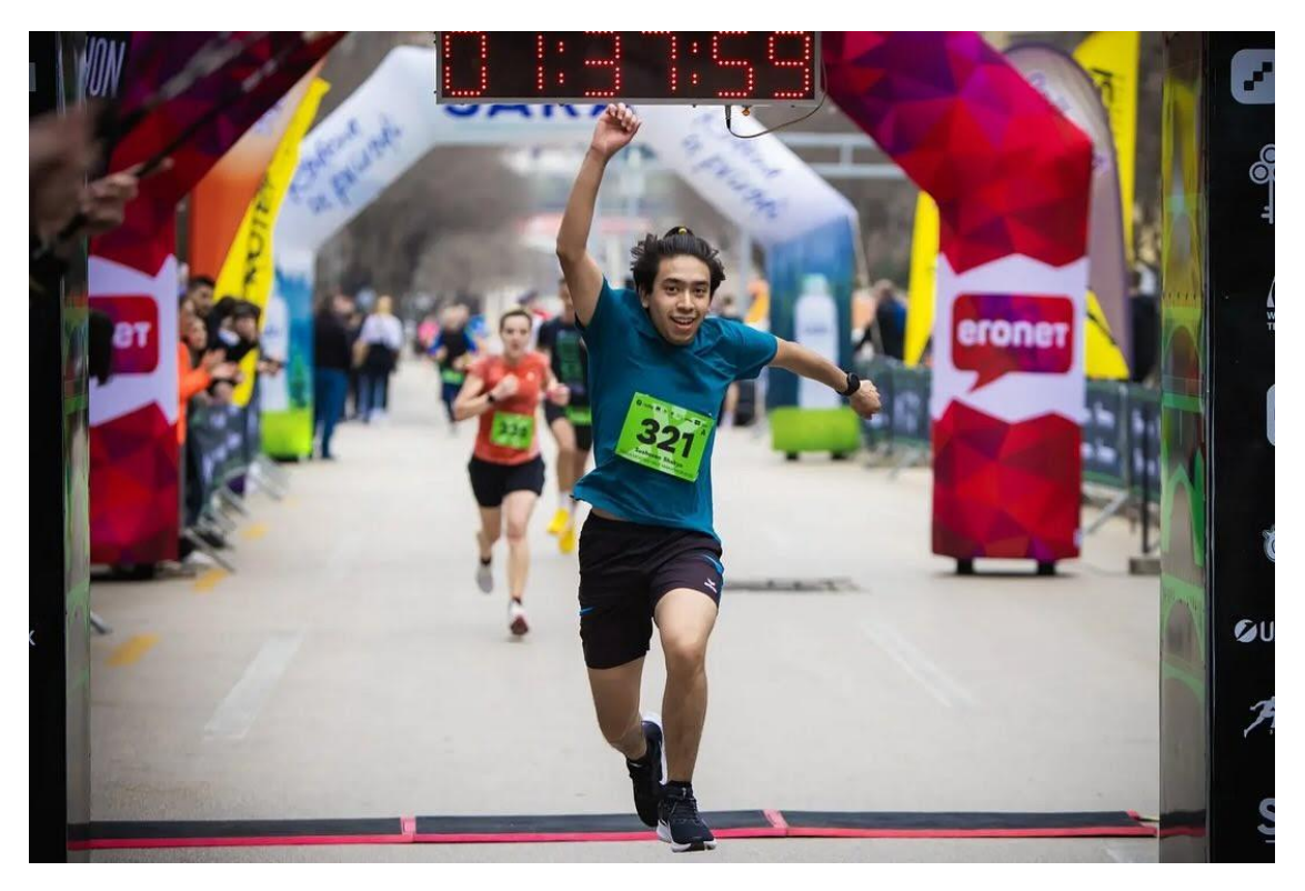
UWC Mostar Team at Mostar Half Marathon

The Mostar Half Marathon and 4K brought together runners, supporters, and an amazing spirit of perseverance and community.