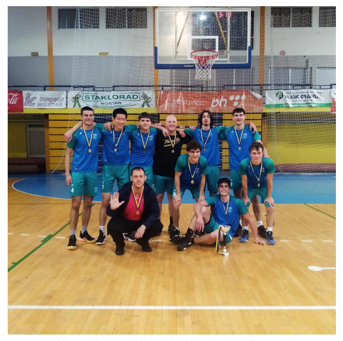
UWC Mostar Wins the 2025 Mostar High School Basketball Tournament!

Out of 17 participating schools, the UWC Mostar male basketball team emerged champions in the 2025 Mostar High School Basketball Tournament organized by Sports Association of the City of Mostar.