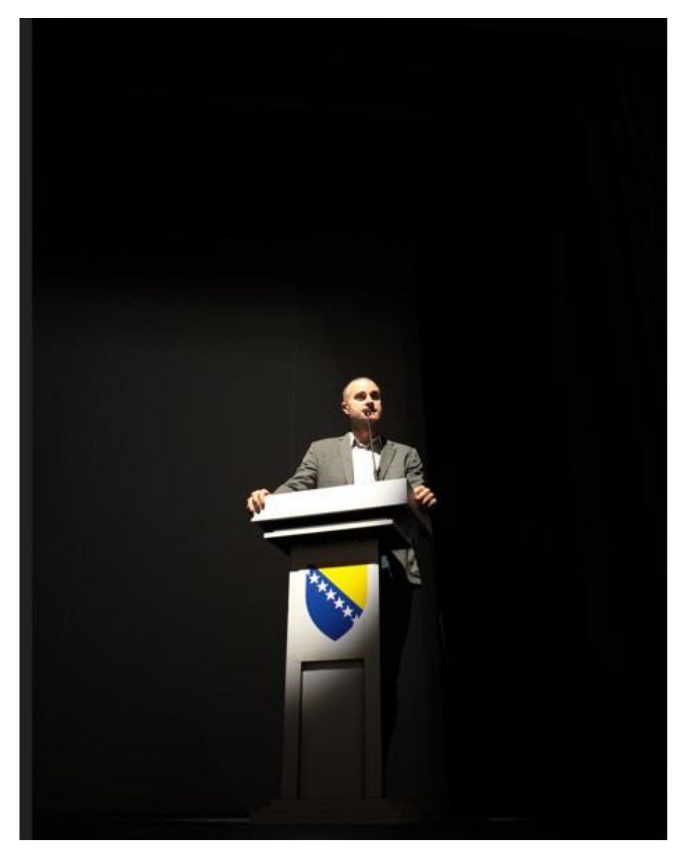
Model United Nations Conference in Mostar UWC Mostar MUN Conference 2025 – A Week of Diplomacy & Debate!

UWC Mostar proudly hosted the MUN Conference 2025, bringing together passionate young leaders for an incredible weekend of debate, diplomacy, and global problem-solving. The event was a resounding success, with delegates engaging in thought-provoking discussions on some of the most pressing international issues.